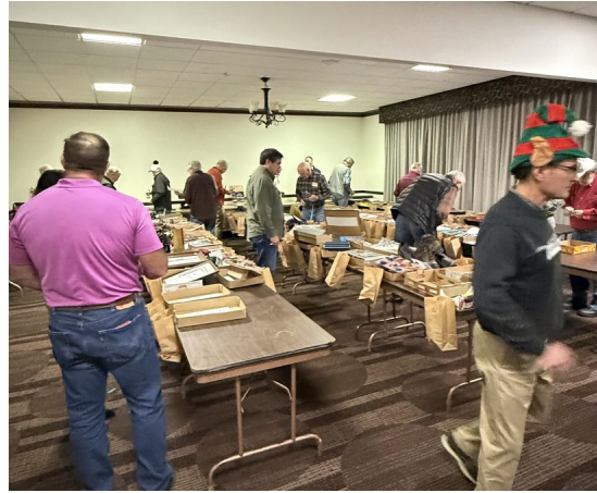
Folks check out the many terrific raffle and silent auction items!