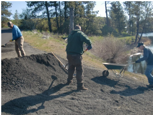
Volunteers hard at work spreading the gravel.