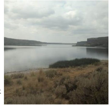
Coffee Pot Lake

We will be sending out additional information and asking for an rsvp as we get closer. Look for it in your emails.