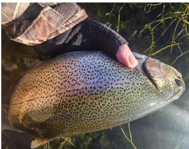
Another fine example of a Rocky Ford Rainbow

Inland Empire Fly Fishing Club—Spokane, Washington