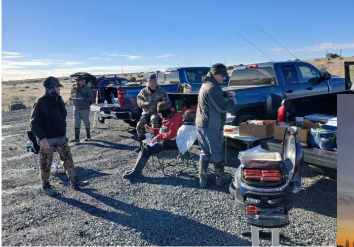
Lunch break and warm up