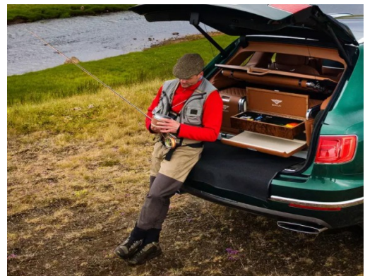
Anonymous Member of Elite Fly Club

The purchase has so depleted the number of hatchery fish available that WDFW has reduced the number of fish stocking they will be doing this year. A few examples were reported with Williams Lake numbers being reduced from 180,000 fish to a total of 250 with only 25 of those being triploids. Amber Lake is being cut down from 5,000 trout to the ridiculous level of just 10 trout and only one of those will be a triploid. For those of you still with me please don't call WDFW as I hope you realize this is the annual April Fools article. And I hope I didn't get anyones blood boiling too much. Enjoy the rest of the issue. I believe it is mostly true. This story is obviously not.