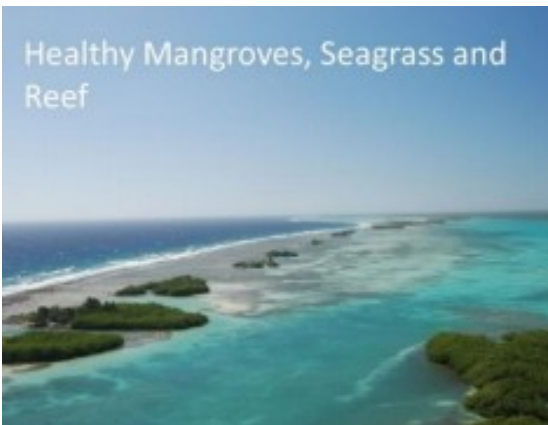
Healthy Mangroves, Seagrass and Reef

Karnali River in Nepal- An FFI grant is supporting efforts to create a protected river corridor along the Karnali River in western Nepal as an alternative to main stem damming for hydropower. This grant is contingent upon receipt of other grants being sought for this project.