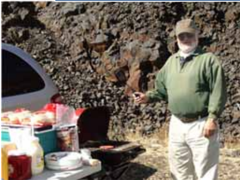
If you weren't there you missed Swede's culinary skills. The burgers were great.