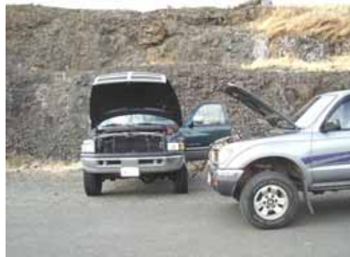
What's this? A branch of the B.C. Open Hood Cult? See The Fly Leaf, November 2006