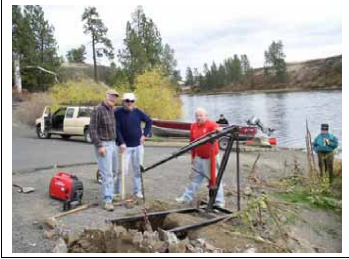
Digging holes for the sign was a struggle