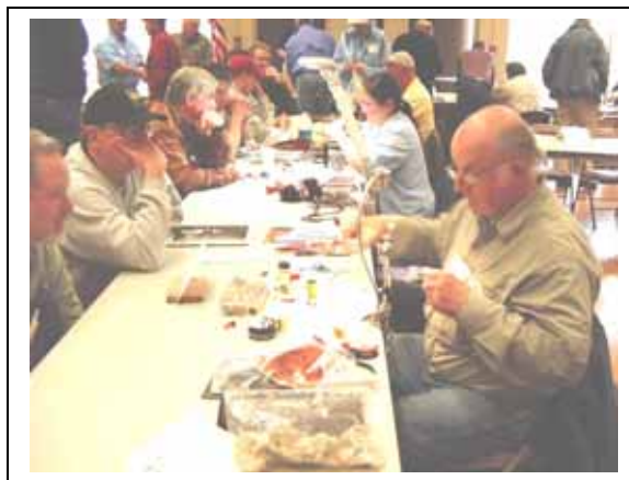
A few busy tiers at Fly Tying Expo, Ellensburg, WA, April 21, 2007

New Address: 1105 North Evergreen Spokane, WA 99201 Phone: (same) 448-4421 E-mail: fmpainc@hotmail.com