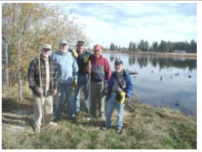
Way down the tunnel a hard working crew is laying waste to the vicious weeds. You have to look carefully to see them. They are making life easier for us to fish N. Silver.