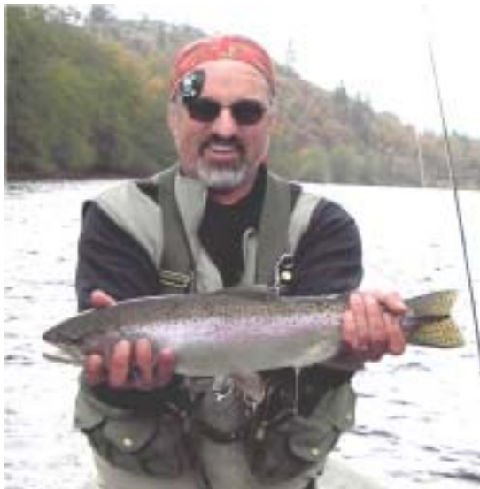
A Rogue Pirate