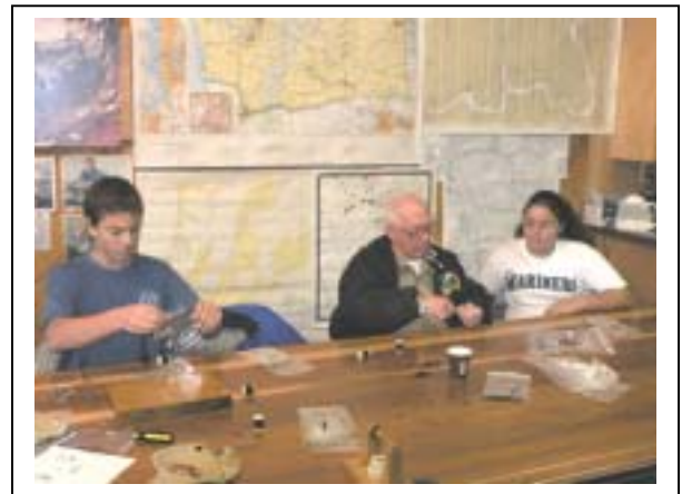
Fly tying session. Each participant tied at least one fly. Next time we will have casting pictures.